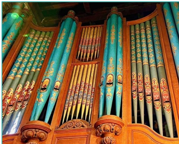
St Andrew's Church Organ

Director of Music at New College School, Oxford and former Organist at St Augustine's Abbey, Ramsgate