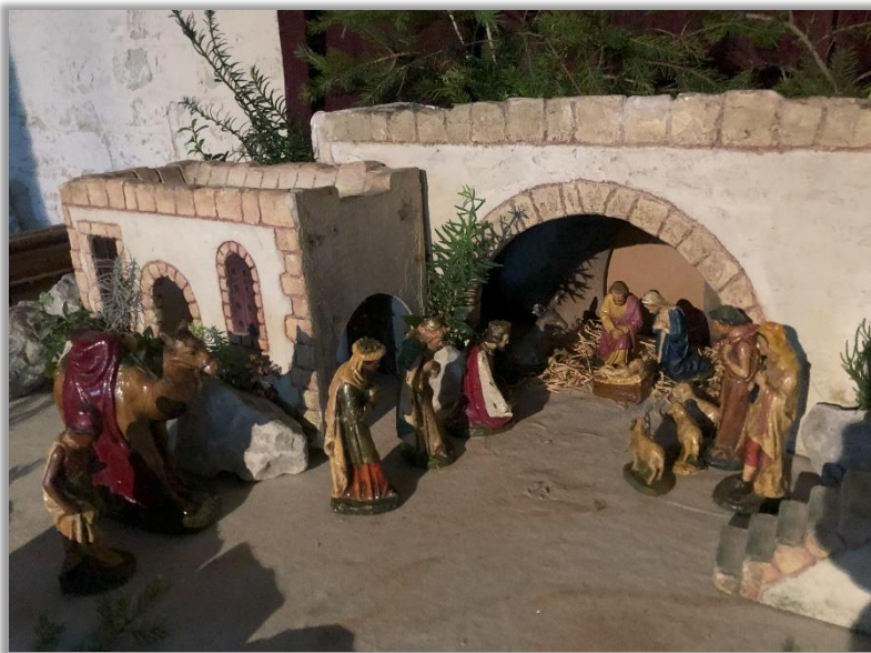
Nativity scene in St Mary's Church, Ashbury