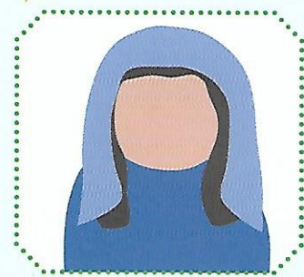
Make Mary's face happy after the angel tells her not to be afraid.