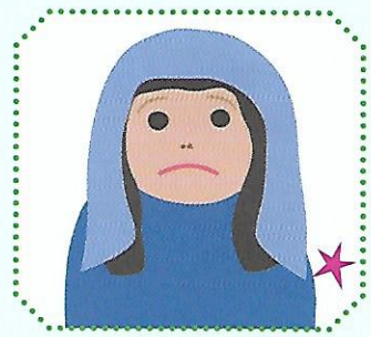
Mary was worried when the angel Gabriel first appeared.