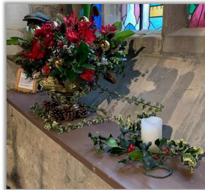
Christmas flowers in St Mary's Church, Longcot