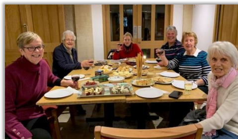
The Longcot flower team