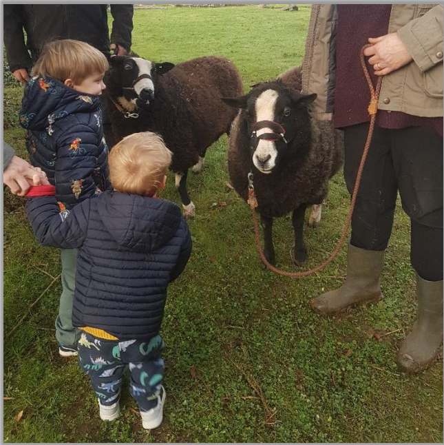
The children helped to prepare the crib and sang Away in a Manger (with a little help from the choir).