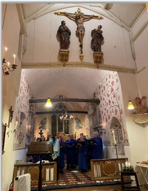
St Swithun's Church, Compton Beauchamp