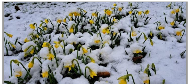
Daffodils peeping through the snow.