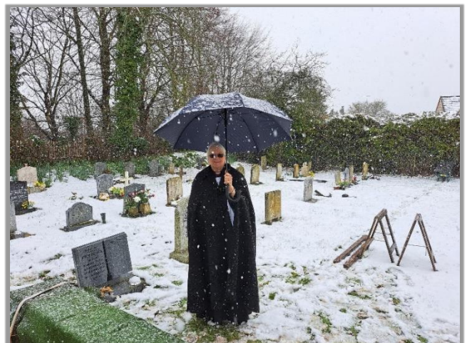
Ashbury churchyard.