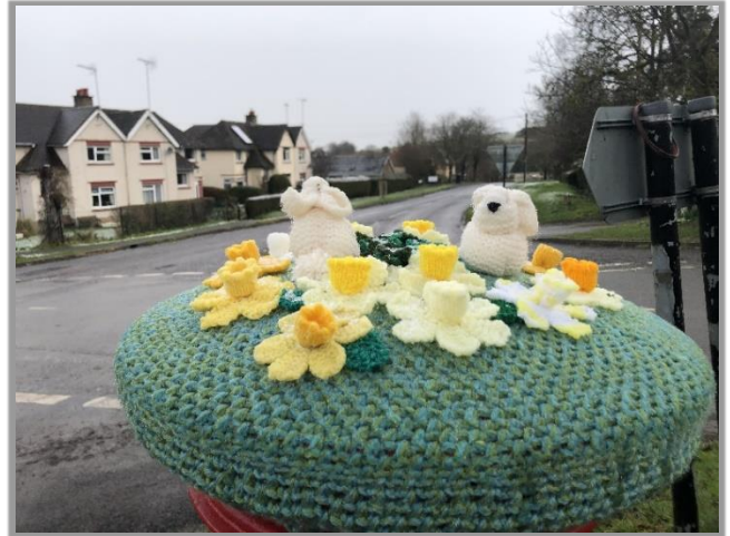
Ashbury crossroads post box.