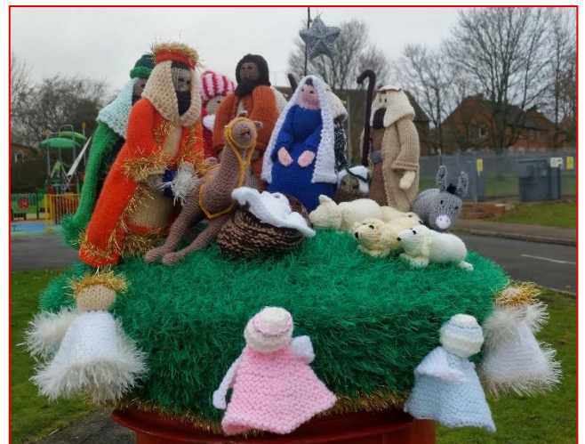
Knitted nativity on a Watchfield post box

vicar@shrivenhamandashbury.co.uk 01793 784338