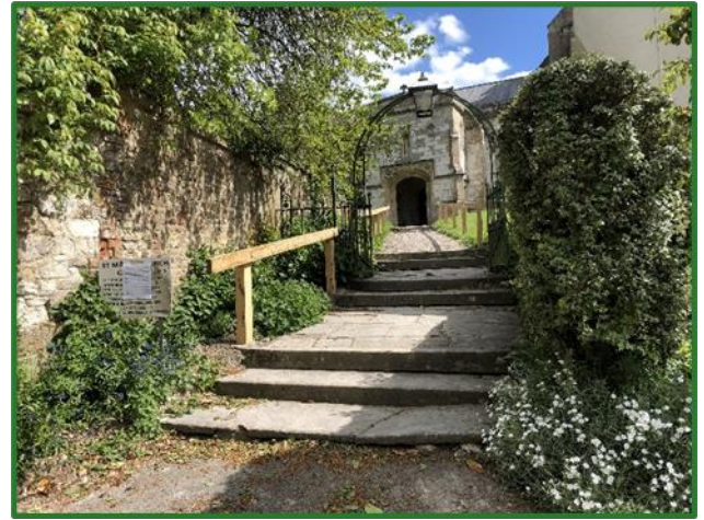
New handrails at St Mary's Ashbury

Please pray this week for all who live and work in Malthouse Close.