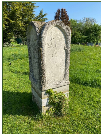
"The Four Seasons"